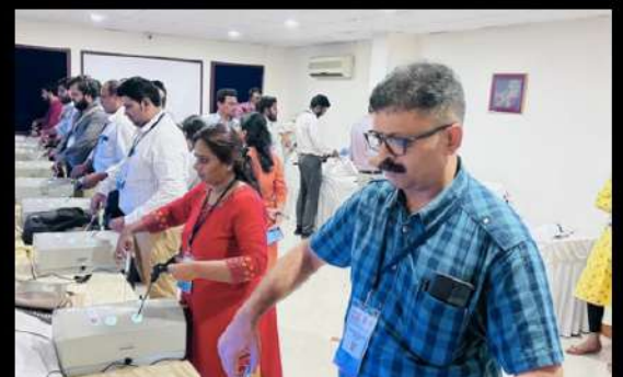
Delegates at the Endo- trainer Session