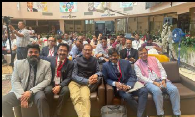
Faculty and Delegates, Mumbai