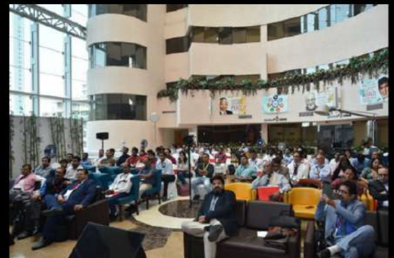
Excellent ambience in Glass Palace, Mumbai