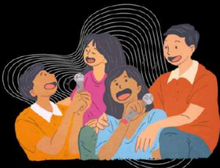
Tapping into your social connections.