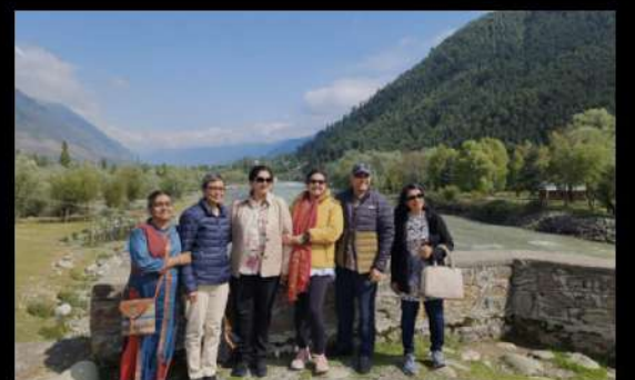
Faculty enjoying scenic Gulmark