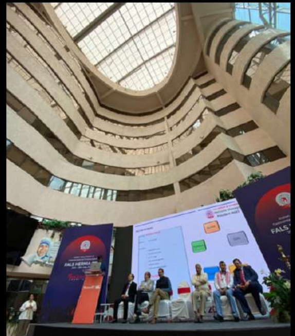
Auditorium at glance Mumbai