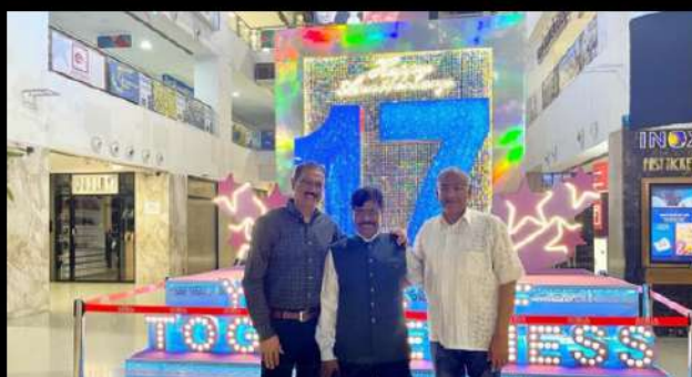
Core team Fals Hernia, Mumbai