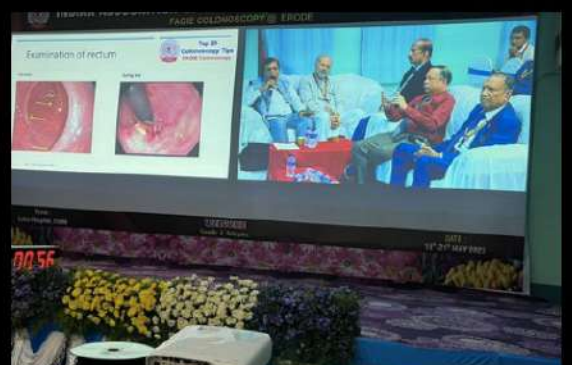
Complications of colonoscopy, Erode