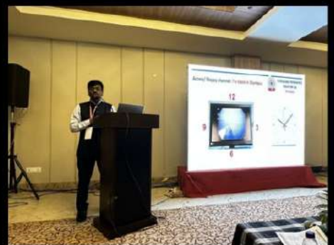
President speaks at Cuttack