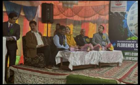
Inauguration ceremony at Srinagar Fiages