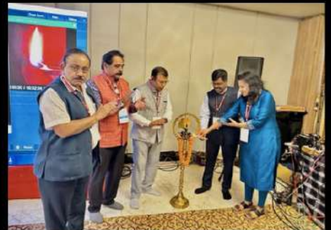
Inauguration ceremony at Cuttack