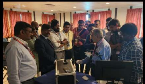
Delegates learning from BKR sir, Pondicherry