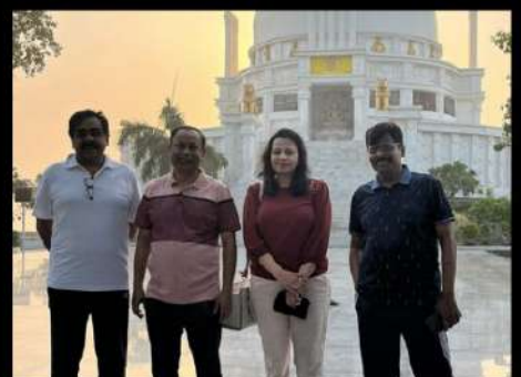
Buddhist temple visit