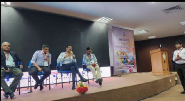
Bariatric panel discussion