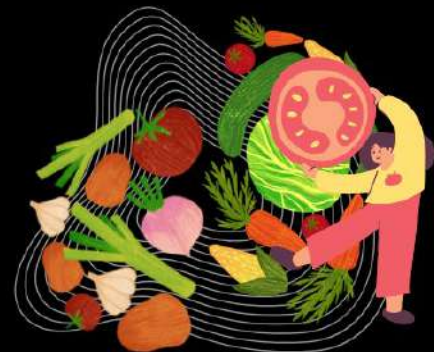
Eating a diet high in fruits and vegetables

American Heart Association (AHA) recommendations for physical activity – 30 minutes of moderate-intensity exercise five times a week or 25 minutes of vigorous-intensity exercise three times a week.