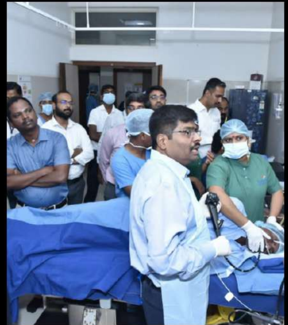
President sir demonstrating Endoscopy techniques