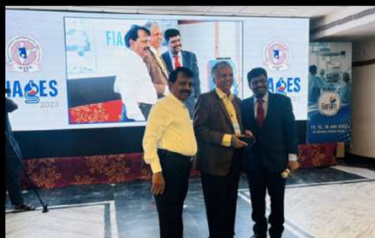
Core team Fals Hernia, Mumbai