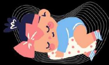
Getting a good night's sleep