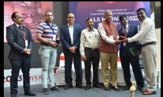
Felicitation of Armed Forces candidate Mumbai