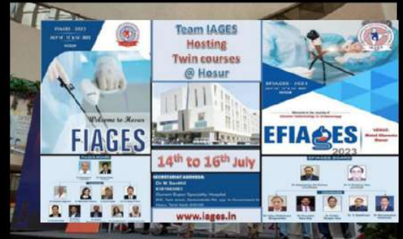
Welcome to the Hosur Twin program