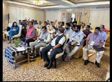
The delegates at Cuttack