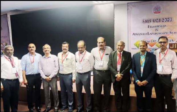
Faculty fals upper GI Jipmer