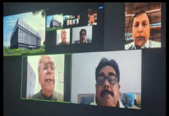
Moderators from across the globe, Erode