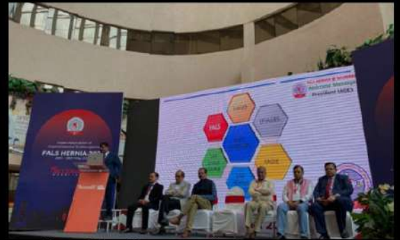
President sir's address Mumbai