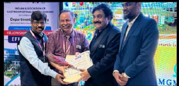
Faculty felicitation, Pondicherry