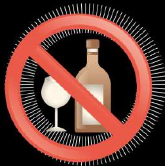
Avoiding alcohol /substance use