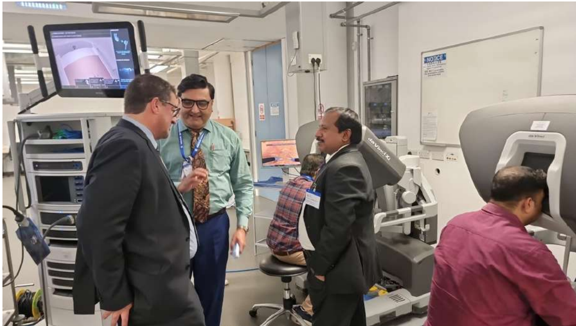
ROBOTIC HANDS ON COURSE 11.10.23 AT RCS EDIN