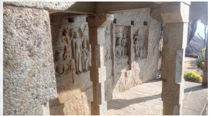
Chitharal Jain Rock Cut Temple