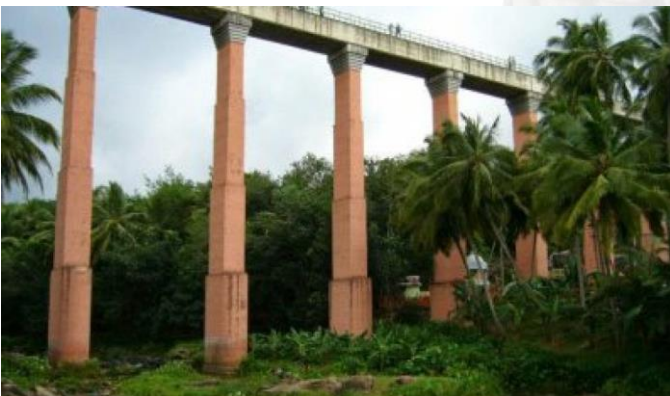
Mathoor Hanging Bridge