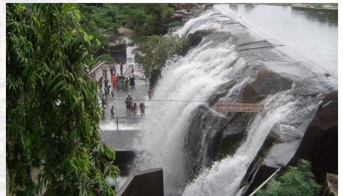
Thiruparappu Water Falls