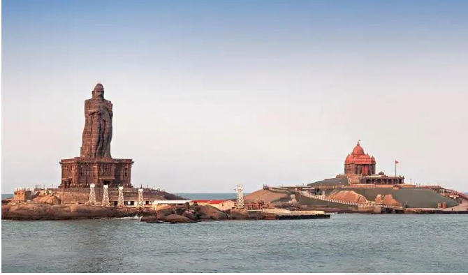
Beach, Vivekananda Mandapam and Thiruvalluvar Statue at Kanniyakumari