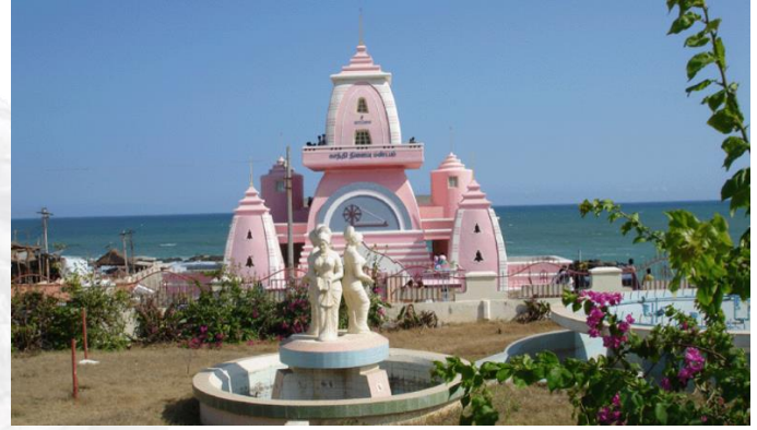
Mahatma Gandhi Mandap at Kanniyakumari